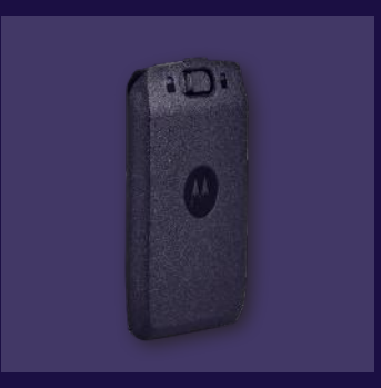
HKNN4013ASP01 BT90 STANDARD CAPACITY BATTERY