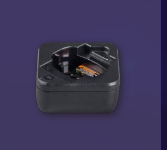
PMPN4587 SINGLE-UNIT CHARGER